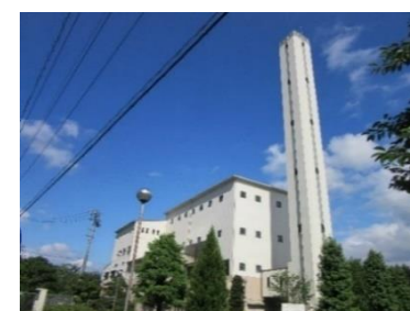
Shinshiro Clean Center