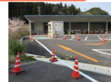
Oversized Garbage Collection Site

Combustible garbage • Oversized garbage (Combustible only)