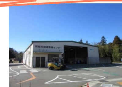
Shinshiro Recyclable Materials Collection Center