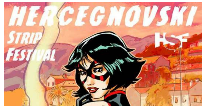
The thirteenth edition of one of the officially best strip festivals in this part of Europe ends at "Peoples" beach bar with the concert of the great Serbian rock band Viva Vops.

the Narcissus HR Giger (CHF 10'000 endowed by the City of Neuchâtel). The international jury also recognized Miguel Llansó's creative hysteria JESUS SHOWS YOU THE WAY TO THE HIGHWAY with the Best Production Design Award.