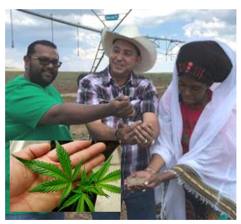
Thanks to Newcastle Advertiser for the story and photo

He says "this can bring global markets to our doorstep and foreign currency into KZN. It will increase the value of farms, recondition the land and create opportunity for farm labourers to be paid bigger salaries. We want to bring the world to South Africa and to KZN and Newcastle in particular, and say, 'We are open for business!' "