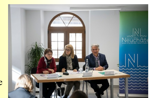
Members of the Conseil Communal launch the assembly.

In Neuchâtel this is an initiative that residents have been waiting for since the merger brought surrounding villages into the municipality. The first assembly will take place in Valangin on 29 March.