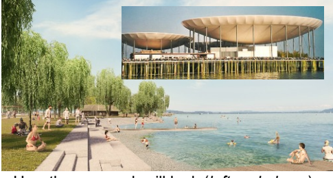
How the new park will look (left and above) with an image from the 2002 Expo inset