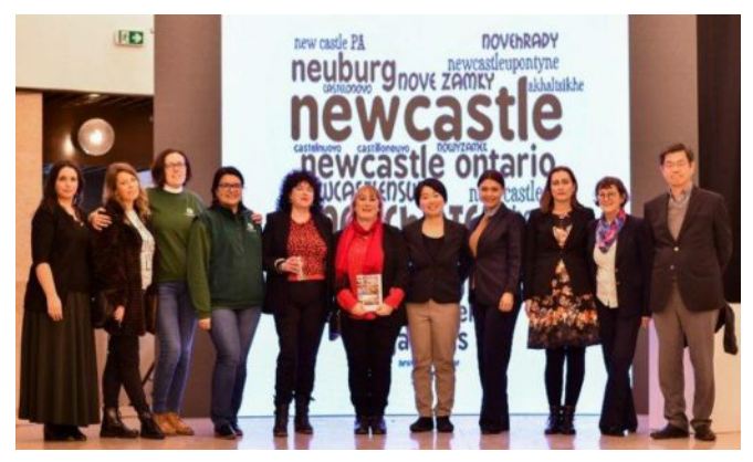
Visitors and hosts at the opening of the Newcastles of the World exhibition in Herceg Novi , our Newcastle in Montenegro. Herceg Novi municipality included Newcastles of the World day, plus a 3 week exhibition, as part of their famous Mimosa Festival this year.

Cherry blossom time in Shinshiro - see page 3 for more photos, and from other Newcastles