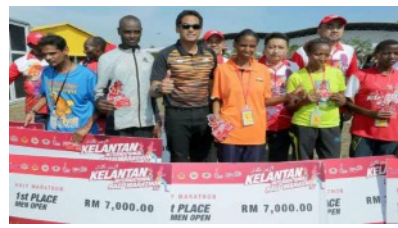
Winners of the first Kelantan half marathon in Kota Bharu, Malaysia