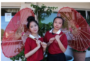
South Africa is the "rainbow nation" where many cultures live together. Our Newcastle in KwaZulu-Natal is truly diverse. Children attending the Chinese school have been enjoying finding out more about their own traditions from instructors who visit from China and Taiwan.