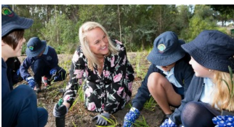
Newcastle City Council in Australia marked National Tree Day with a tree-planting event for school students on Friday ahead of a community planting working bee. Lord Mayor Nuatali Nelmes joined over 200 students from three local schools at Stevenson Park for the National Schools Tree Day event.