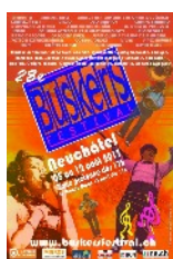
Neuchâtel's traditional "buskers festival" - 15 guest groups take up residence in the city streets for 5 days in August