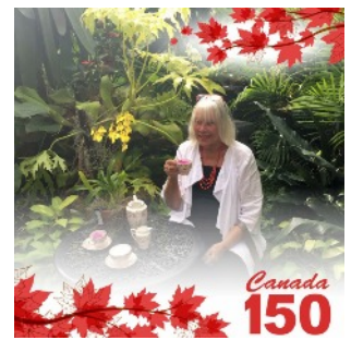
Celebrating a very special Canada Day on July 1 st in Newcastle, Ontario - this year Canada is 150 years old!