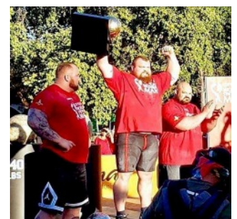
Eddie Hall of Newcastle-under-Lyme has won the title of the "World's Strongest Man" in Botswana.