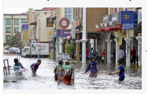
Children playing in a flooded street in Kota Bharu

A number of presentations were given from Ministerial and other representatives about what challenges and opportunities lie ahead in the next EU rural programme 2014 – 2020. This was followed by workshops on Rural Environment, Rural Heritage, Rural Skills and Resources, Rural Community Life and Rural Enterprise.